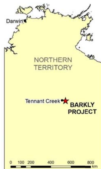
Figure 4 – Location of the Barkly Cu-Au project

The Bluebird copper-gold prospect at the Barkly Project comprises a 1.6km-long gravity ridge open to the east where shallow geochemical drilling by Meteoric Resources identified a 600m-long copper anomaly, also open to the east. Previously reported follow-up drilling confirmed Tennant Creek-style copper-gold mineralisation associated with ironstone. The ironstones and mineralisation are often discordant to the host sediments and are considered to be a high-grade variant of the iron oxide-copper-gold (IOCG) deposits found in Proterozoic terranes in Australia.