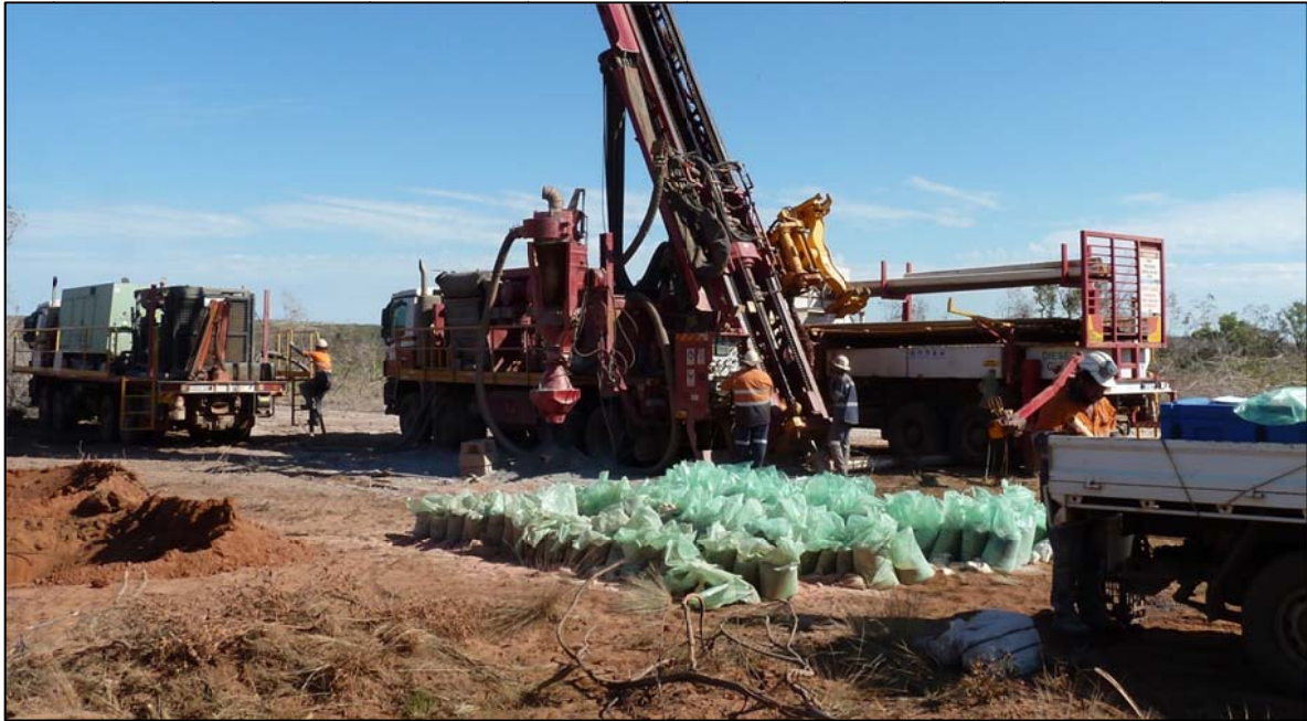
Figure 1 – Drilling operations at BBRC-5, Bluebird Prospect, Tennant Creek